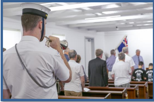
The Bugler during the Minute Silence, HMAS Armidale Day at HMAS Stirling Chapel.

After the service, guests walked to the HMAS Stirling Museum and were able to view the different historical items on display before making their way to Sir James Stirling Mess. The Mess overlooks Cockburn sound which is a view not many people outside the Navy get to see.