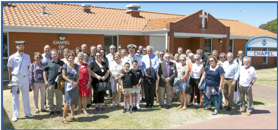
Participants of the HMAS Armidale Day Service, at HMAS Stirling Chapel, Garden Island on the 1 st of December 2019.

The day started with approximately 40 guests arriving at 1pm at HMAS Stirling Pass Office at the entrance to Garden Island Western Australia after receiving a positive response to initial expressions of interest for this, the inaugural Remembering HMAS Armidale service.